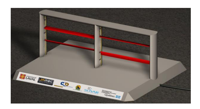
Figure 3 Example of an oscillating foil device