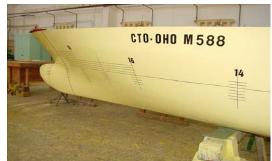
Figure 3: Photos of M588 -Navigator model